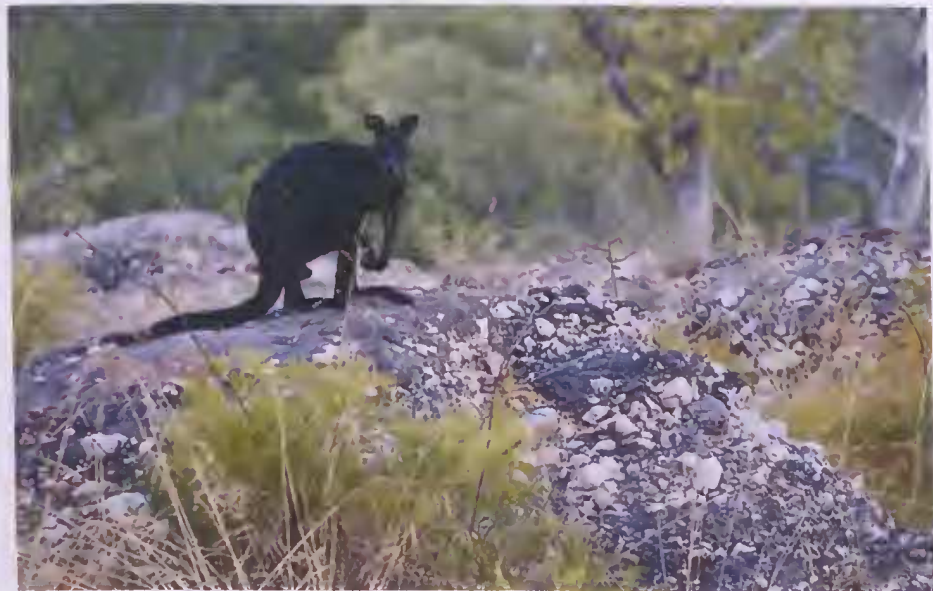
Fig. 1. Black Wallaroo ( Macropus bernardus ).

In a 1998 paper, Telfer et al. compiled Aboriginal knowledge of rock kangaroo feeding habits that included numerous anecdotal accounts of opportunistic macropod frugivory – even though the dominant understanding of foraging behavior has defined these animals as intermediate browsers/grazers (Tuft et al. 2011). A later study (Telfer and Bowman 2006) using scat contents to explore niche separation among northern macropods found that at least one of the species, Macropus bernardus , may be able to inhabit the most rugged and severe habitat because of its ability to utilise leaves, fruits and seeds from a range of rock-specialist plants during dry seasons. In conjunction with this work, Telfer et al. (2006) designed a scat identification key to determine current